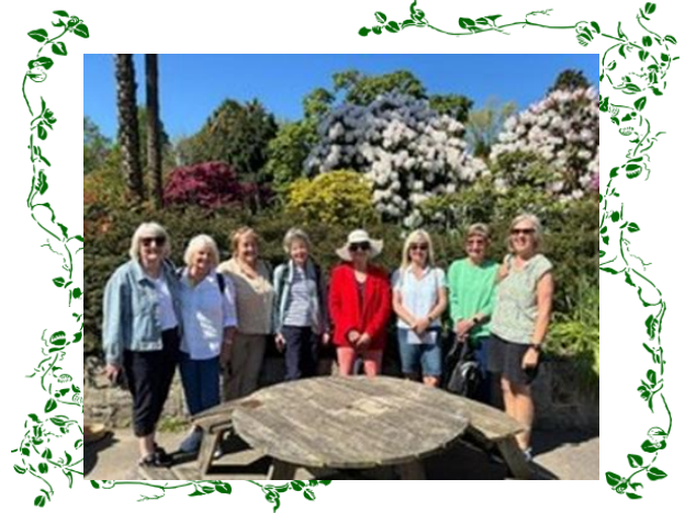
A wonderful day was had by our ladies at Leonardslee Gardens