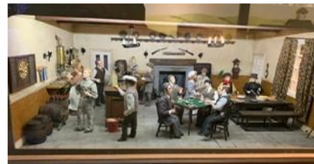
THE AMAZING DOLLS' HOUSE